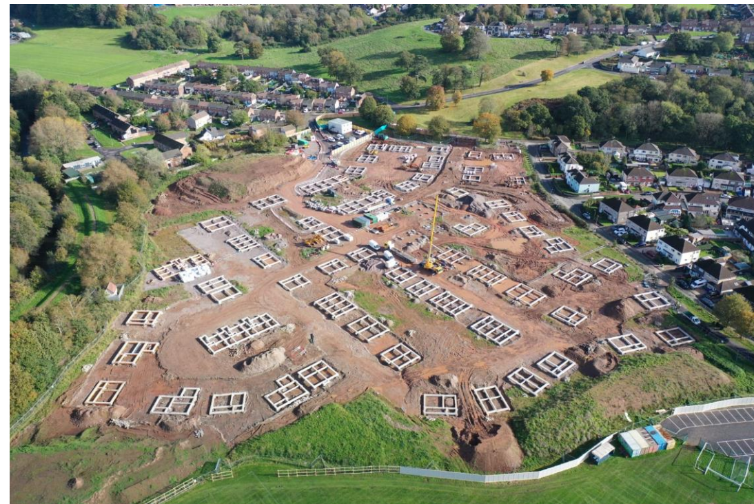
Smartfoot modular ground beams on the site of the former Llanrumney High School