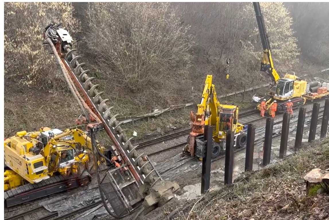
King Post Wall Piles UC Columns for the Faversham to Dover Priority improvement project