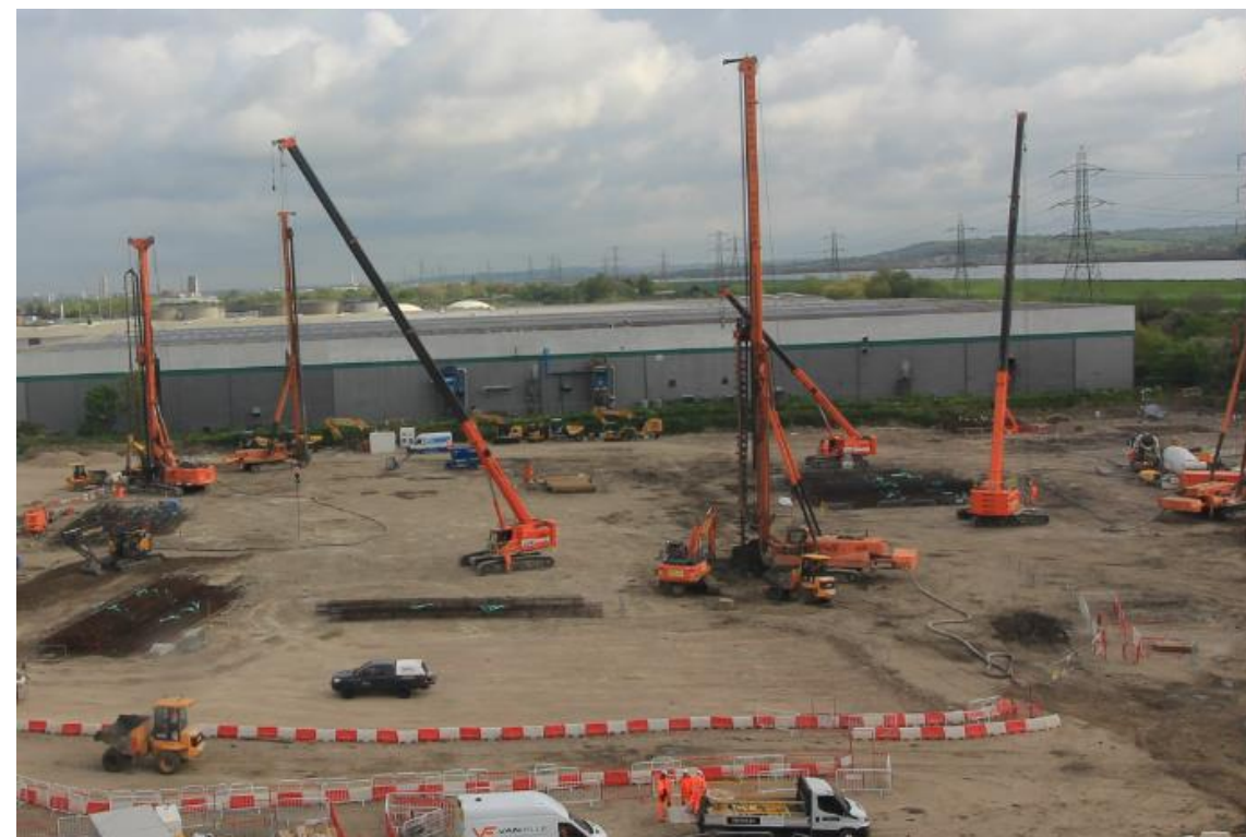
CFA piles installed at North London Heat and Power Plant